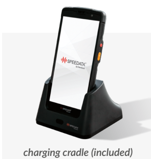
charging cradle (included)