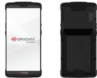
backside and front of the SD55UHF